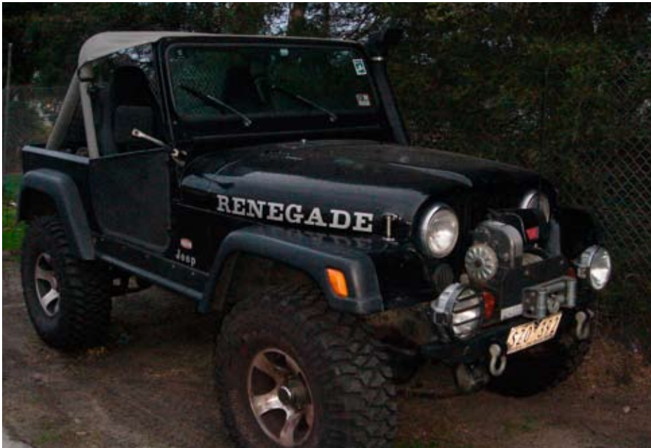
CJ7 requiring engine surgery