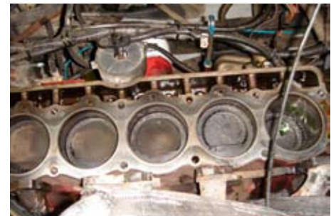
Head removed from motor