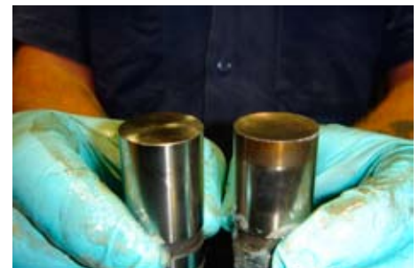
Hydraulic lifters – new one on left, worn on right

Older Jeeps find their way to us and one particularly famous old CJ7 that was once known as SUB-CJ has wound up in the USA 4X4 operating theatre.